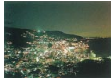
Night View of Atami (Atami City)