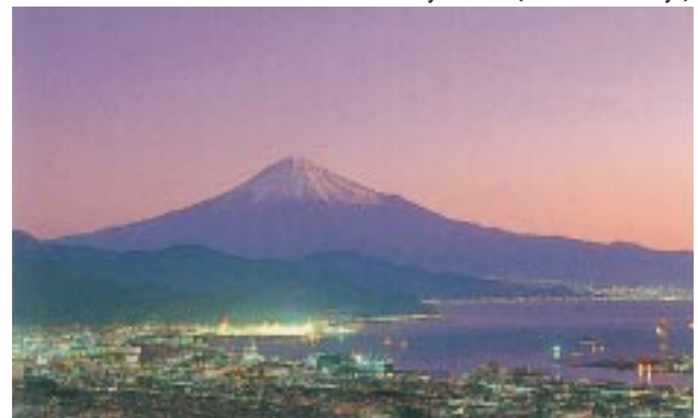
View of Mt. Fuji from the Nihondaira Plateau (Shizuoka City)