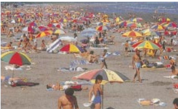
Beaches (Haibara Town, Sagara Town)