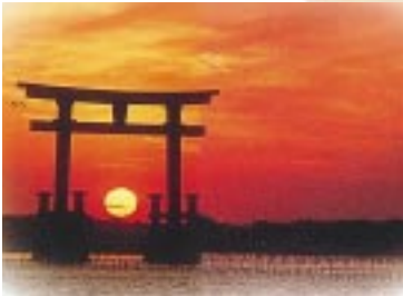
Benten-jima Hot Spring