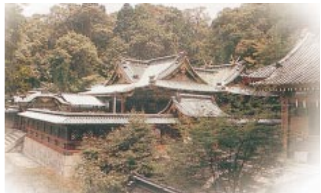
Mt. Kuno Toshogu Shrine ( Shizuoka City )