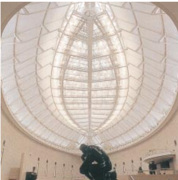
Shizuoka Prefectural Museum ( Shizuoka City )